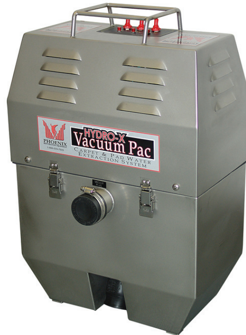
Phoenix Hydro-X Vacuum Pac PN 4025601